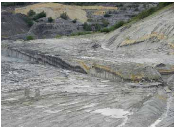
A ball clay mine at Bovey Tracey