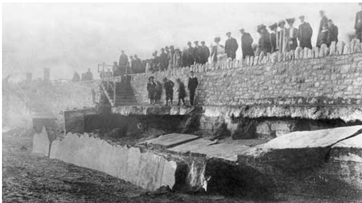
Storm damage to the seawall (1908)

The seawall that you are walking along was also built in the 1920s and space was created on the beach side for bathing huts, tents and kiosks. Of course the seawall not only creates a pleasant Promenade for tourists it also has an important function as a defensive structure. Since the 1960s there have been major floods in the town centre. Earlier we saw flood defences along the Back Beach but there have also been investments here along the main beach to prevent flooding.