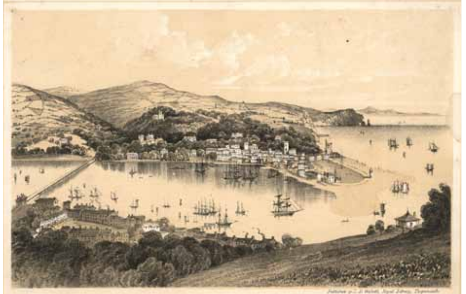
Teignmouth and Shaldon from near the Torquay Road (c.1850)

Originally the River Tame, which left the Great Marsh and flowed along Lower Brook Street that we saw earlier, entered the estuary of the River Teign somewhere near here where Somerset Place is now.