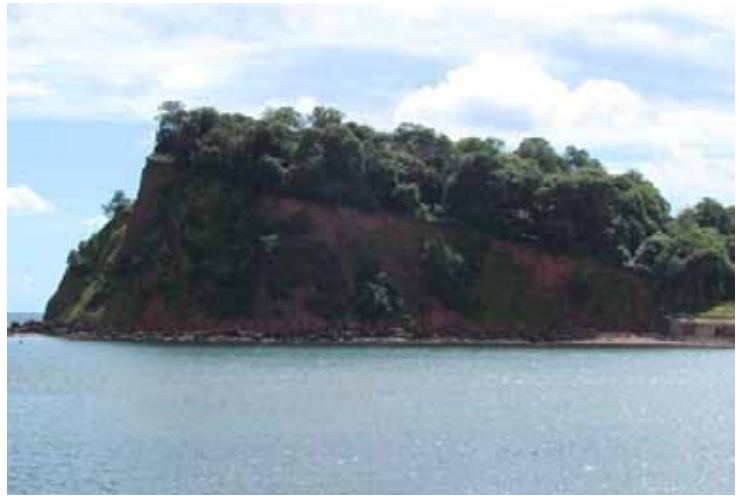
The Ness

The answer lies across the water in the wooded cliffs on the opposite side of the estuary mouth. That is The Ness, a headland composed mainly of red sandstone.