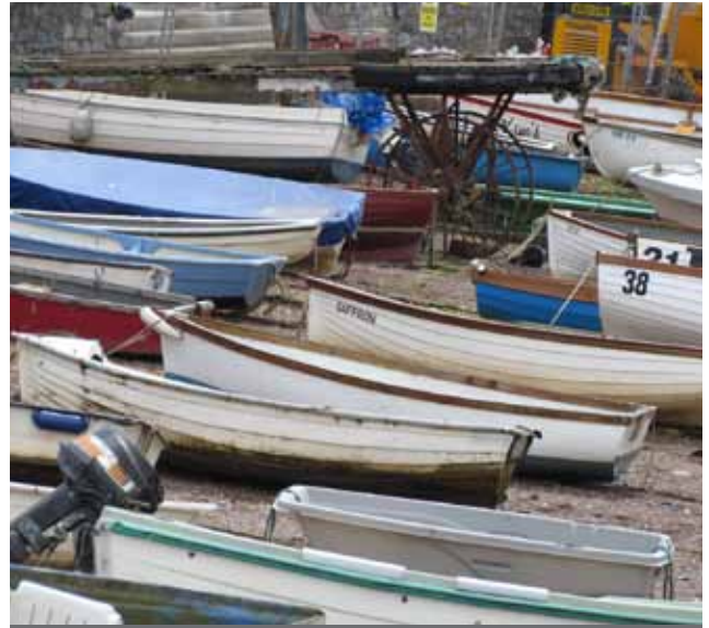
Small boats along Back Beach

The boom period for shipbuilding was the late 1800s. It began in 1849 with the arrival of a man called James Mansfield who was attracted by the proximity of the port to the new main railway line and the rail siding leading directly into the Old Port. He built wooden schooners and yachts for the surrounding gentry. By the late nineteenth century iron replaced wood and most of the shipyards closed although small boat building continued on the Shaldon side of the estuary.