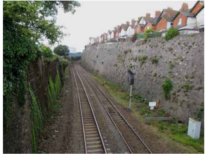
Teignmouth railway cutting

The railway network was expanding rapidly in the mid-nineteenth century. The first serious proposals for an Exeter to Plymouth railway were mooted in 1835 and the engineer, Isambard Kingdom Brunel, surveyed a possible route in 1836. There were a number of difficulties posed by building a railway line between Exeter and Newton Abbot including the underlying geology, undulating landscape and coastal erosion.