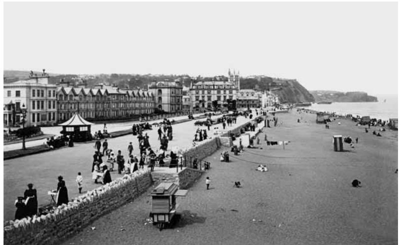
Teignmouth promenade seen from the pier (1896)

At the last stop we heard about the process of coastal erosion and deposition which created the enormous sand bank that you have been walking along. Many centuries ago it was an area of rough, sandy grassland used for grazing sheep and for drying or mending fishing nets. By the 1700s it had also developed into a social gathering place. The diarist Fanny Burney who we heard from earlier described donkey and pig races, cricket matches and wrestling on the Den during her visit in 1773.