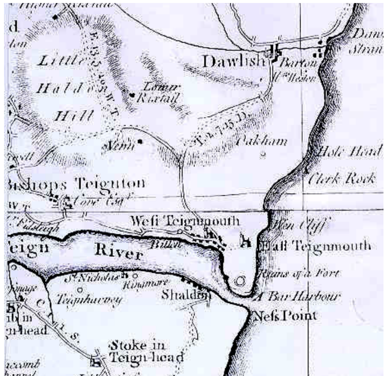
This 1765 map shows East and West Teignmouth as separate villages

The Great Marsh separated the two settlements of East and West Teignmouth but from the mid-eighteenth century there were moves to drain the marsh, reclaim the land and join the two villages. This can be seen on various old maps between 1765 and 1801 including 'The Long Bridge' in the 1700s. By an 1836 map the reclamation of the Marsh appears to be complete and this is the first instance of the settlement being labelled as a single Teignmouth without the East and West division.