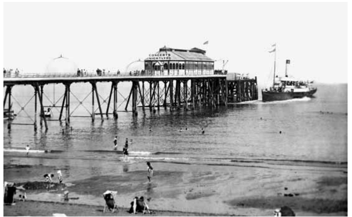
Teignmouth Pier and steamer (1925)

The Pier dates from 1865. It was built originally as a landing stage for passengers of coastal steamers but as tourism grew in the 1920s it became a pleasure pier with a ballroom and shops. The pier also served to separate the Ladies' Bathing Beach below where you are standing now from the Gentlemen's Bathing Beach on the other side.