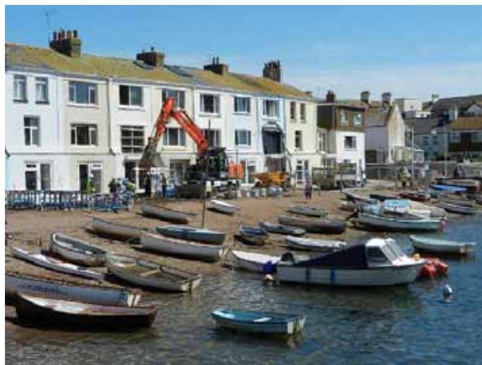
Works on the Back Beach to improve the flood defences

Some of the worst floods were in 1980 but I have seen significant damage too. Waves often reach half way up the ground floor windows, which I witnessed a couple of years ago, and water flows up the narrow streets from the beach inundating Somerset Place, Northumberland Place and Teign Street.