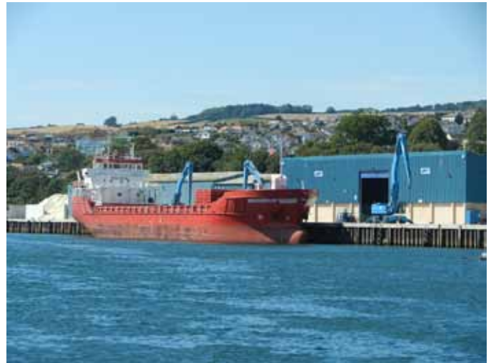
A short sea trader ship at Teignmouth port

Did you know that Teignmouth is the only major working port on the south coast between Southampton and Plymouth? You can see many of the berths and storage buildings from this point. The port's five new berths can handle ships up to 120 metres long with a 5 metre draught. About 35 to 40 ships a month pass through here. Aside from the 200,000 tonnes of ball clay handled by the port every year there is also 200,000 tonnes of other bulk products including animal feed, grain, stone chippings, salt and forest products. The port is completely computerised for stock control, delivery and tracing materials and works on the 'Just In Time' system especially for the ball clay.