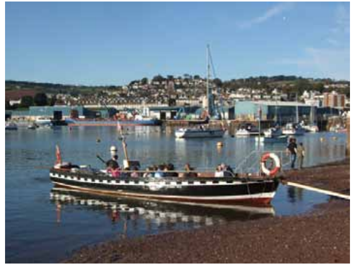
The Shaldon ferry

The ferry used to dock slightly further back down the quay at Ye Olde Jolly Sailor Inn on Gales Hill that we passed earlier (that pub used to be called the Ferry Boat Inn). Now it docks here at the end of Lifeboat Lane. If you have a bit of time I thoroughly recommend a trip across and back again. It will give you an alternative view of Teignmouth.