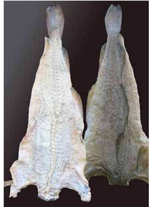
Salted and dried cod

Fish became a staple food in Devon, particularly when meat was scarce during the winter months. Fortunes were made from the cod fishing trade although life was not easy, either on board the small 100-ton fishing boats or for the families left at home.