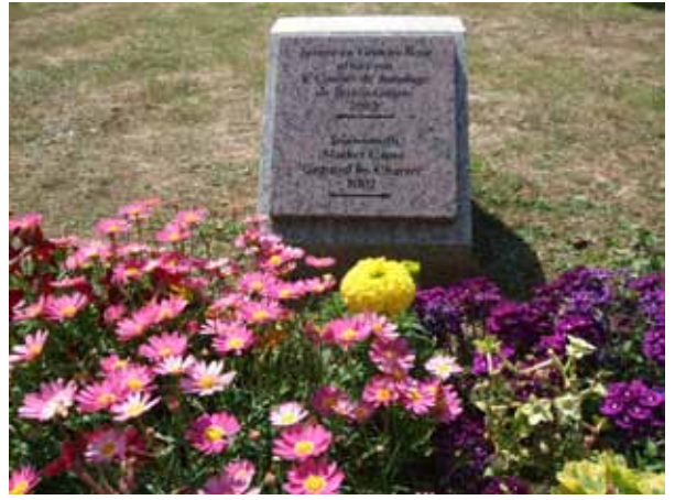
The pink granite plaque commemorates a more friendly relationship with France

Ironically, Teignmouth is now twinned with Perros Guirec in Brittany although they have imported onions and potatoes from there for over a hundred years. The pink granite walls, too, around the grassy area are gifts from France. There is a plaque on the opposite wall to commemorate the two events.