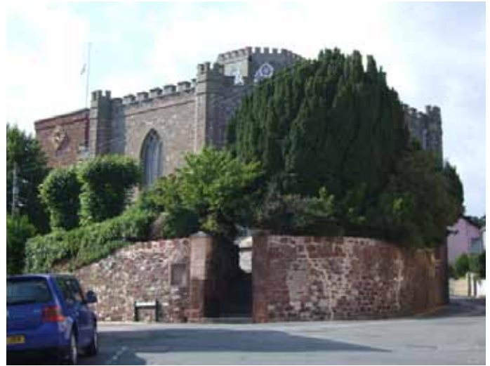
St James Church with its historic clocktower

It was situated on a well-drained slope up above the Great Marsh and the estuary. Fore Street that you are on led down to a sheltered anchorage on the Teign shoreline. As well as easy access to the sea for fishing there was also access to the surrounding countryside.