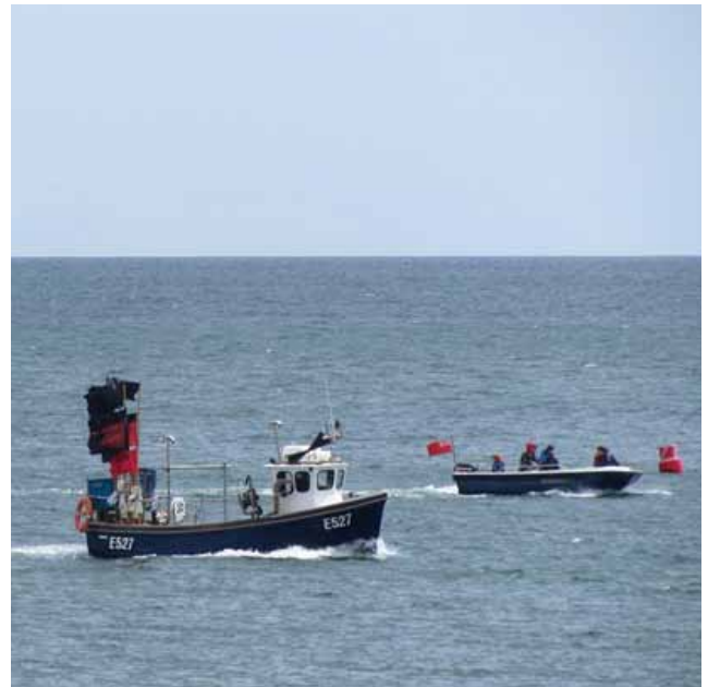
Teignmouth fishing boats

As we have already heard, the people of East and West Teignmouth have caught fish here for at least 1,000 years, both in the river estuary and the inshore waters. Pilchards, herrings and sprats were all important fish to the local economy as well as the famous Teign mussels.