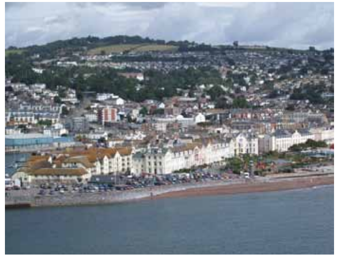
Teignmouth town - full of hidden stories

We have also seen how humans through the ages have tried to tame and control the physical landscape including draining a marsh, culverting rivers, reclaiming mud flats, flattening sand dunes, building a seawall and installing flood defences.