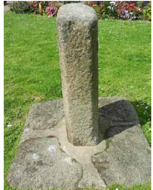
The stump of Teignmouth market cross

St Michael's Church that we saw at the last stop was positioned on an elevated ridge which made it visible from both land and sea. In 1690 the French navy had just beaten the English and Dutch at the Battle of Beachy Head. The French Fleet were moored at Torbay just down the coast from here and as they moved along the coast they spotted St Michael's Church.