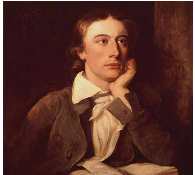
Portrait of John Keats, perhaps musing over the weather in Teignmouth...

However Keats wrote that he could see from his window 'a pretty valley, pretty cliffs' and perhaps that moved him to write an 'Ode to the Teign' which is reproduced here on the wall of the New Quay Inn. It starts "Here all summer I could stay..." so the weather must have got better for him!