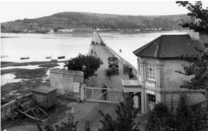
Shaldon Bridge and toll house (1922)

The bridge that you can see crossing the estuary in the distance was built in 1827 by the Shaldon Bridge Company. The original bridge was 1,671 feet long and made of wood with a swing section in the centre that allowed tall ships to pass.