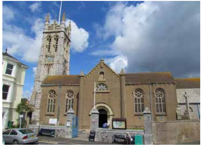
St Michael's Church

The seawall that you are standing on is relatively recent. The sea used to come right up to the churchyard wall. There are accounts of great storms, one in 1744, even washing away graves.