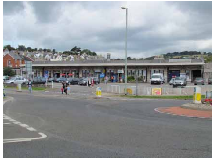
Site of the Great Marsh

Look across to the station building. To the left and right of it you can see that the land rises quite steeply yet the station and car park seem to be on quite a suddenly flat area.