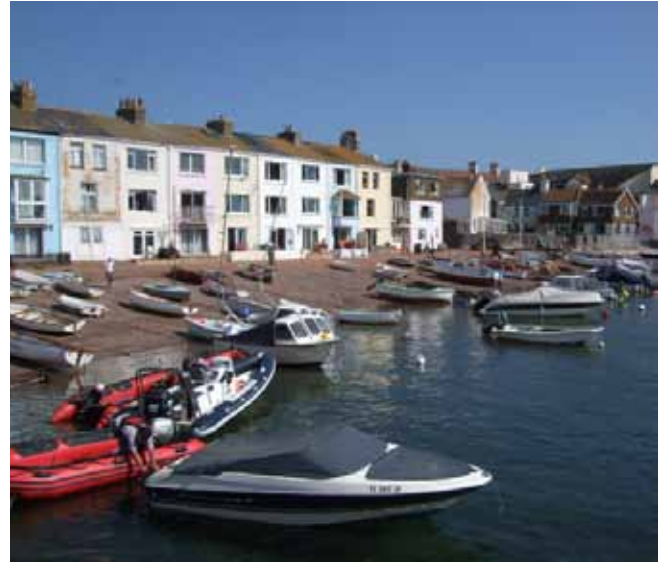
Back Beach, Teignmouth

If you ask someone what comes to mind when you say Devon, they might mention seaside holidays in places like Torquay, driving over the moors of Dartmoor, or perhaps sampling the county's famous cream teas! Few will mention Teignmouth. This walk gives you the opportunity to find out more and discover Teignmouth is not just another Devon seaside resort.