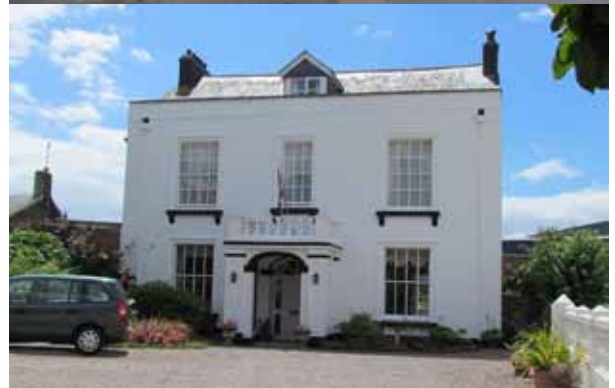
The old fish store (top) and Thomas Luny House