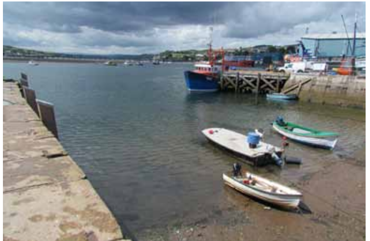
View up the estuary from the New Quay

In the late 1700s a man called George Templer owned various granite quarries on Dartmoor. But the stone needed to be transported. He constructed a strange railway with tracks carved out of granite to the Stover Canal which linked to the Teign.